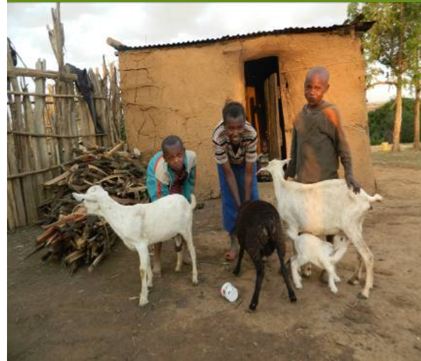
Goats to boost household income. Narok, Kenya, 2019.

In 2019, LIA-Kenya celebrated its close partnership with local partner churches and the greater ownership of program activities. Several churches were trained on community transformation, families were empowered through saving groups and started diversified income generating activities (IGAs), and the most vulnerable children were supported with their education and health.